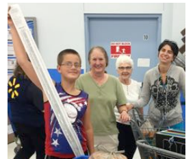
After spending the morning sorting and shopping, Mt. 25 volunteers stretch out a receipt listing $1,616.17 of newly bought back-to-school items.

We have worked to meet a wide range of needs for local school children, single mothers, disaster victims, mental health clients, an Orthodox orphanage, and prisoners, among others. Members participate in some or all of the activities as their schedules permit.