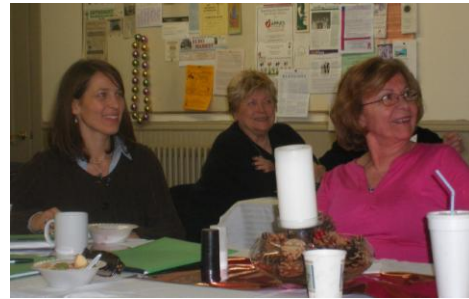
Good conversations begin with good questions