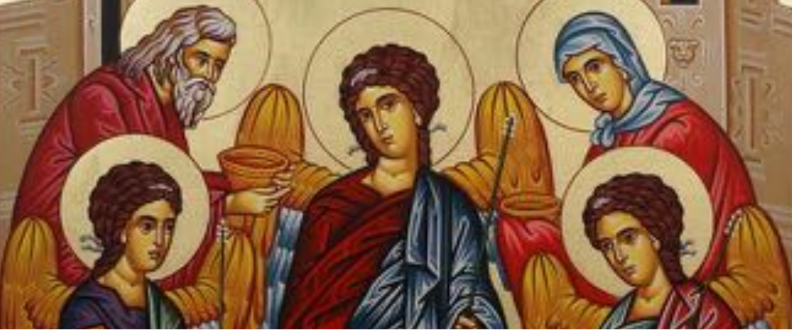
When he was 99, God gave Abram a new name based on the covenant He made with him, “Abraham” (father of many nations). Shortly thereafter, he provided hospitality to three holy men (depicted above), a type of the Holy Trinity. One of them correctly told an incredulous Sarah that she would give birth the following year. The couple did not need to take matters into their own hands after all.

AS WE AWAIT WORD regarding the status of a new rector to be assigned to us, I am reminded of the ancient story of Abram and Sarai. If you recall, Abram had been promised by God that He would make of him a “great nation” and a “blessing” so that “in you,” God vows, “all the tribes of the earth [shall] be blessed” ( Gn. 12:1-3 ). Now, when God spoke all of this, let us remember that Abram nor his beloved wife, Sarai, were spring chickens! At the giving of this divine promise, Abram was 75 years of age.