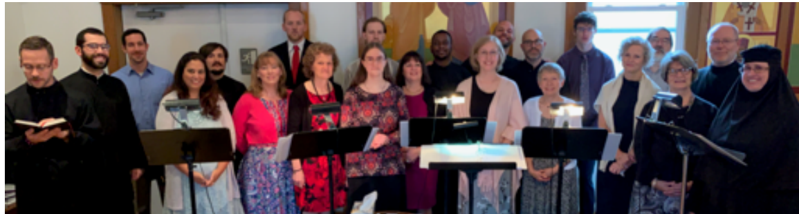
Current and past singers from Holy Trinity and the Chapel came together to sing at the “25 Years of Ministry” Celebration, which took place in October. Beginning this month, the Choir will make a simple, yet profound, change when singing the “Our Father” at Liturgy.