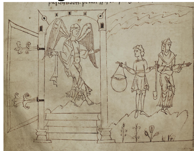
The Expulsion of Adam and Eve as depicted in the Junius Manuscript, a 10 th century Old English collection